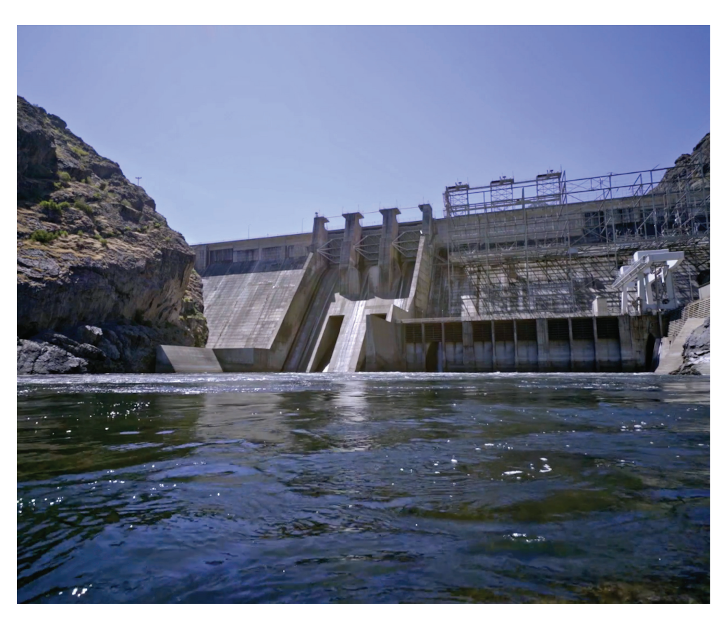
Built in 1958, The Brownlee Dam was the first of three dams built as part of the Hells Canyon Dam Complex. It is part of a system that is completely blocking fish passage in the Snake River.

Pacific Rivers is proud of this substantial contribution to the restoration of fish habitat and to the health of the Snake and Columbia River watersheds.