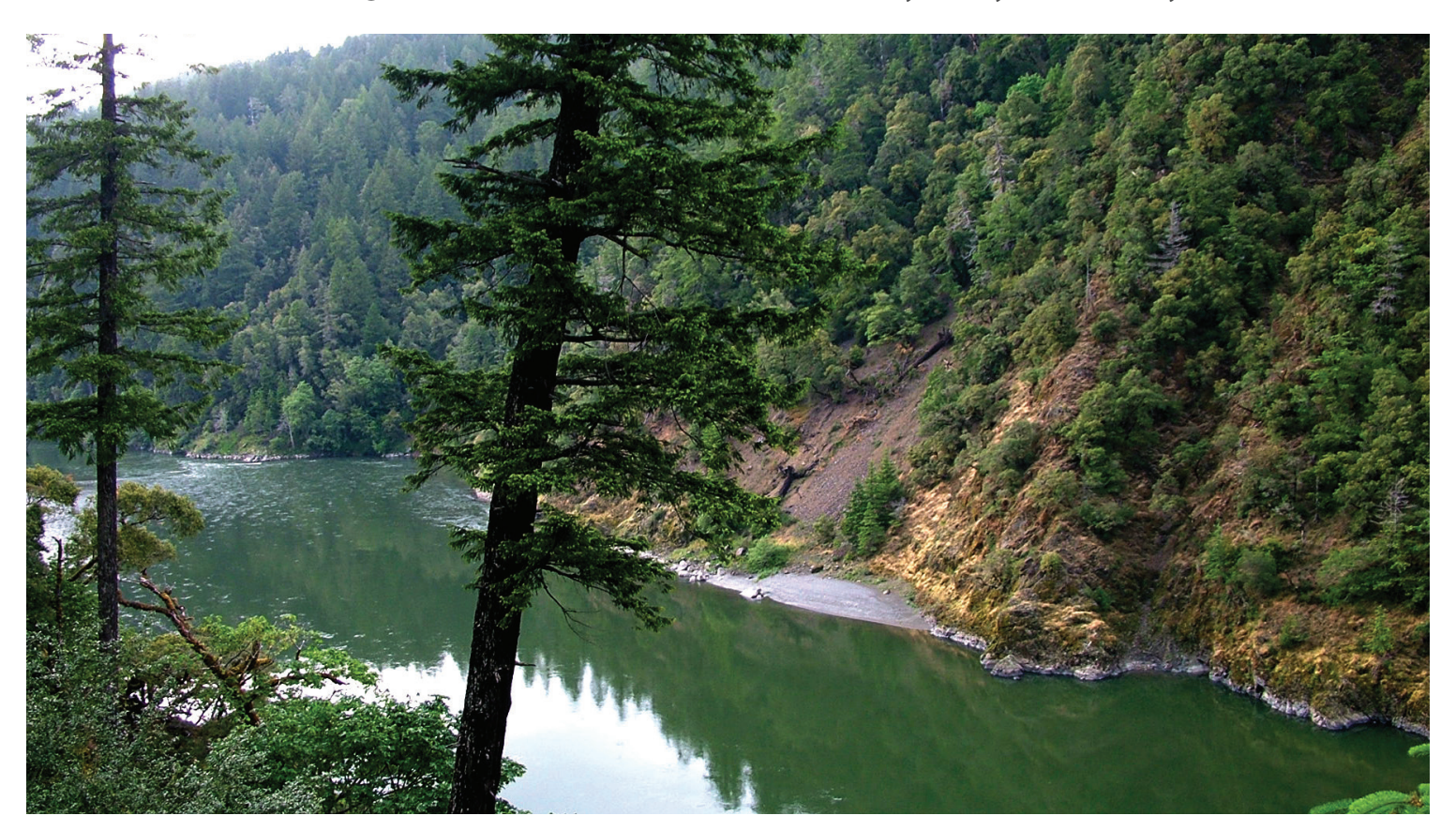
The Lower Rogue, one of the many designated Wild and Scenic Rivers in the state of Oregon.

What's the answer? Manage rivers with continuity from headwaters in the highest mountains to the river estuaries at the Pacific Ocean. Easy to say. Not so easy to do.